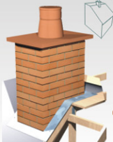
SLOPE TO FLAT