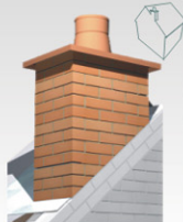
MONO PITCH GABLE